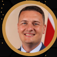
Rt Hon Wes Streeting MP Secretary of State for Health and Social Care